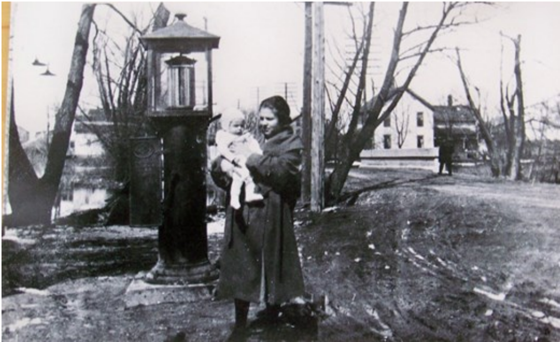
Saginaw Road as it looked in the early 1920s prior to the construction of the Dixie Hwy through Waterford. This photo, taken in front of Willings Garage, is looking west up the muddy road toward the Clinton River bridge that was finally replaced in the fall of 2013.

People who assume Dixie Highway is simply a paved version of the Saginaw Road that preceded it are only half right. Although the route is similar, it is not the same east of old downtown Drayton Plains. The Saginaw Road followed the curving southern shore of Loon lake on the south side of the railroad tracks, not on the north side as it does today. Closer to the downtown, the Saginaw Road crossed the railroad tracks at a crossing which still existed well into the 1940s though there is no longer any sign of it. Just beyond the crossing, Saginaw Road split into two branches, one branch going straight toward the general store, the other proceeded down into the river valley where a bridge crossed the Clinton River at the first of Waterford's two fords.