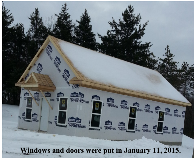
Windows and doors were put in January 11, 2015.